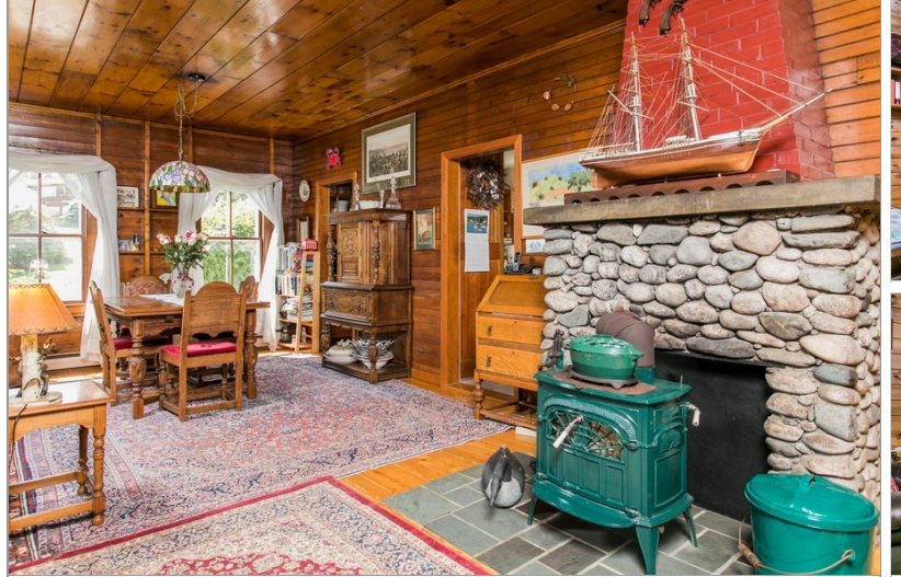
View Online: http://tours.mainevideotours.com/92147

$749,000 | 4 BEDS | 3 BATHROOMS | 2773 SQUARE FEET